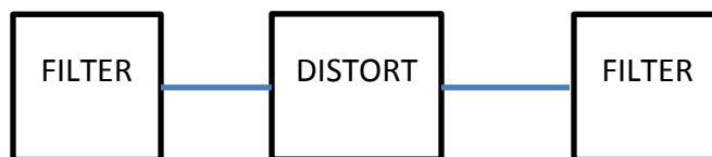
Figure 1: The Fundamental Paradigm of Electric Guitar Tone

Designers soon began to add features to guitar amps to allow tone shaping and other forms of signal manipulation. These very first amplifiers serve as a foundation for the “fundamental paradigm of electric guitar tone” which is a nonlinearity (aka distortion) preceded and followed by filtering. The figure below illustrates the fundamental paradigm.